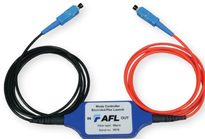
Encircled Flux (EF) Mode Controller

EF Compliant solutions available, see pages 3 - 4 for details